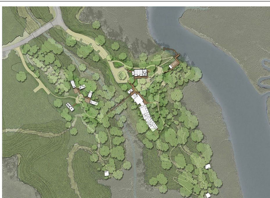
Illustration: Kendal Claus and Phil Zimmerman

Zinc and copper, often favored for their durability, can leach into the watershed and wreak havoc on the marine environment. Instead of a zinc roof, the team selected pre-weathered Galvalume, which is coated with an aluminum-zinc alloy to resist corrosion. For plumbing, the team devised a hybrid system using PVC underground to prevent copper leaching into the watershed, and copper above to prevent a storm surge carrying PVC out to sea.